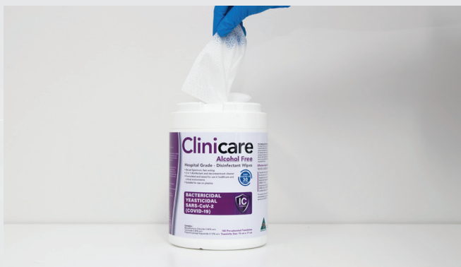
A. Dispense Clinicare towelette