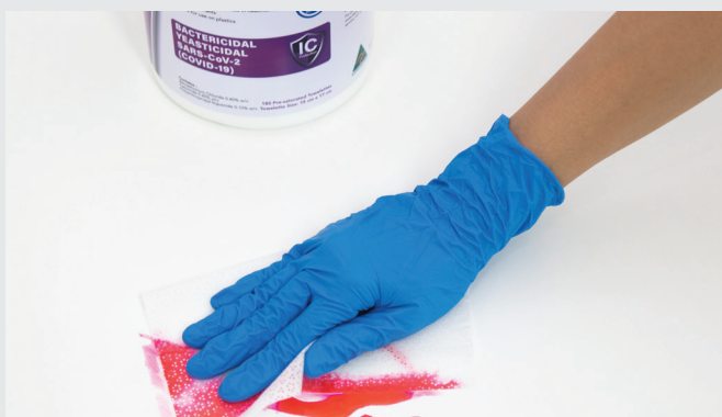
B: Wiping from clean to dirty in an S-shaped pattern, ensuring not to go over the same area twice