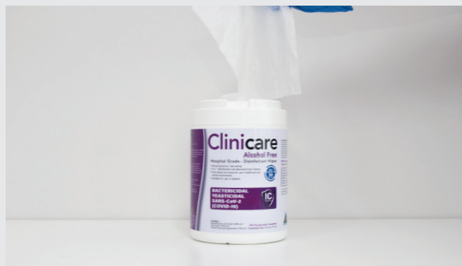
A. Dispense another Clinicare towelette