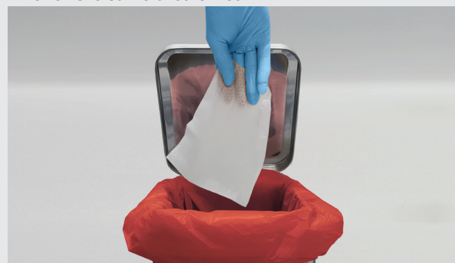
C. Dispose of used towelette