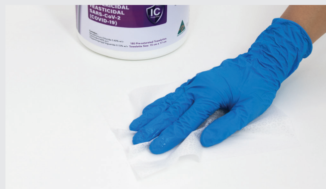
B: Wiping the decontaminated area from top to bottom in an S-shaped pattern, ensuring not to go over the same area twice.